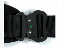
Automatic aluminum buc- kles with locking indicator