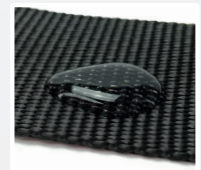
Water repellent webbing