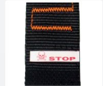
Activated fall indicator