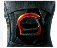
Orange coated back D ring

Padded leg straps with adjustment through automatic buckles